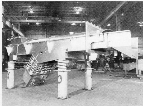
Stainless steel feeder, fitted with dust tight domed cover, handles heavy loads of steel scrap.